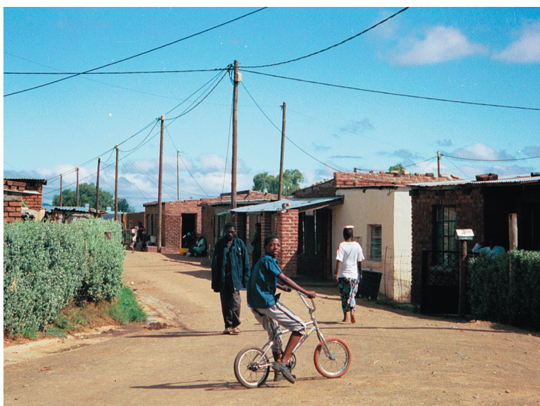
Figure 1: Street scene, eastern Cape, South Africa

Associations between intimate partner violence and situations in which husbands have lower status or fewer resources than their wives 25,36,37 may also be substantially mediated through ideas of successful manhood and crises of male identity. The salient forms of inequality vary between settings. For example, in North America differences in education and occupational prestige convey risk, 25,38 whereas in India employment differences are more important. 9