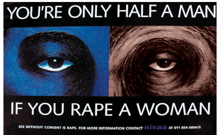
Figure 2: South African poster aimed at changing attitudes

Social support is another source of power for women. In studies from several countries, good social support was shown possibly to be protective against intimate partner violence. 9,12 Temporal issues need clarification as abusive men often restrict their partner's movement and contact with others, and so abused women become isolated. This isolation is compounded by the effects of abuse on women's mental state, which can result in them withdrawing into themselves, and also by problems of compassion fatigue in those who are asked to play a supportive part. 44 Social support during relationship problems has also been associated with increased risk of violence, but it seems likely that the explanation is that some women are more likely to discuss relationship problems when these become more severe. 7 Notwithstanding this factor, social support, especially from a woman's family, may indicate that she is valued, enhance her self-esteem, and be a source of practical assistance during violent experiences or afterwards. 12 Anthropological research indicates that in settings where women are valued in their own right, 42 and the social position